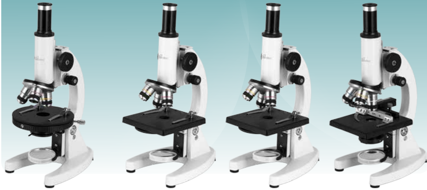
▲ XSP-L101 ▲ XSP-101 ▲ XSP-12 ▲ XSP-13A